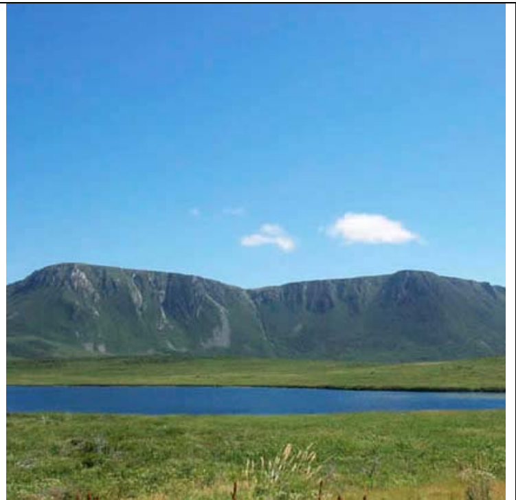
Here is a beautiful picture of the Table Mountains in Codroy Valley.